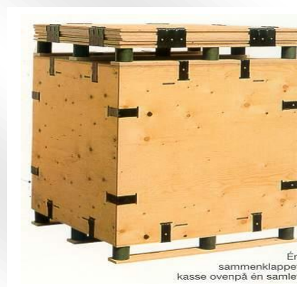
A collapsed container on top of one assembled

The cases are customised to suit the cargo being transported, and therefore come in a wide variety of sizes and models.